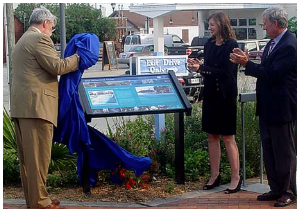
FIRST USS MONITOR TRAIL MARKER North Carolina Maritime Museum, Beaufort