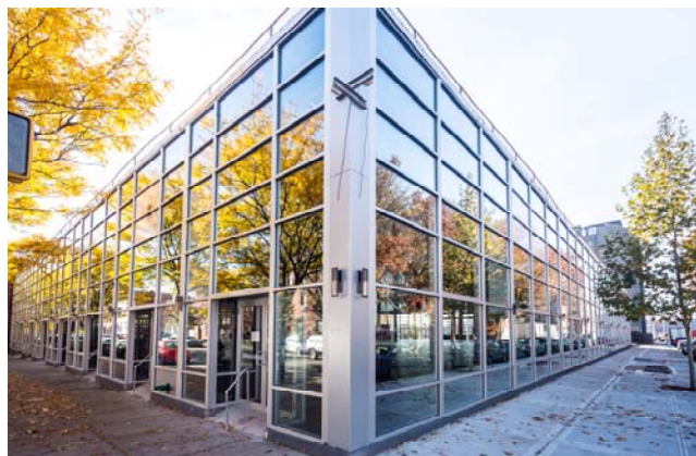
BROOKLYN EXPO CENTER 72 Noble St., Brooklyn, NY 11222

The Greenpoint Monitor Museum P.O. Box 220378, Bklyn, NY 11222 (718-383-2637) http://greenpointmonitormuseum.org