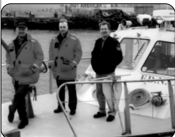
F.D.N.Y. Marine Co. 6