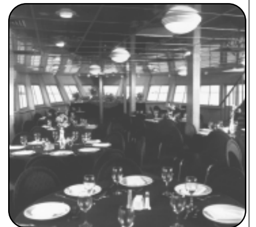
Hudson Jewel Interior