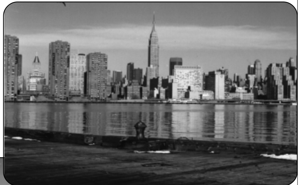
Views from the Lumber Exchange Terminal Pier.