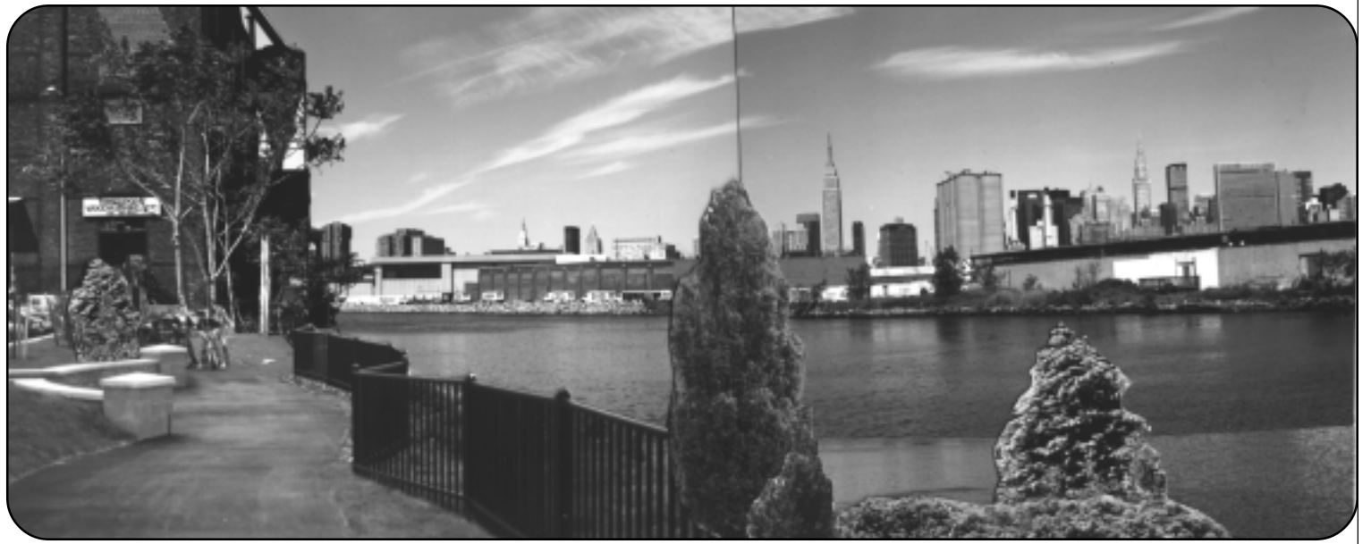
Repaired Bulkhead & Promenade shown by way of a photo montage (prepared for Greenpoint 197-A Plan by the Greenpoint Monitor Museum).

While the 197-A plan is a guide for future development, upcoming construction projects are the key to fast track plan recommendations. A promenade on the Newtown Creek at the end of Manhattan Avenue is a plan recommendation that can become a reality through the Manhattan Avenue reconstruction project. Once a part of the original design, the promenade had been removed from the final design. In addition, Bishop's Crook Lampposts were originally designated for streets only between Calyer St. and Greenpoint Ave. and not the full length of the Avenue. Through calls to City Agencies and petitions containing photo collages illustrating the Promenade and lampposts, the Museum has made and is attempting to make these recommendations a reality. We received notification that the lampposts have been incorporated into the design throughout the length of the Avenue. We are awaiting final word on the status of the Promenade.