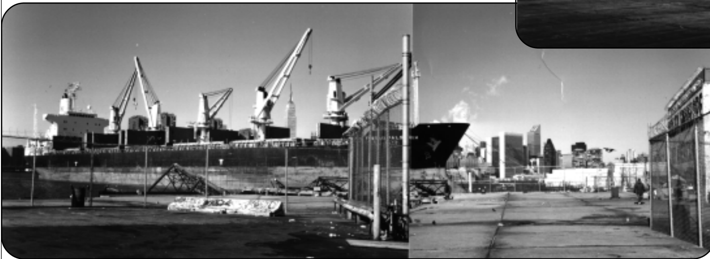
Lumber delivery at the Lumber Exchange Terminal