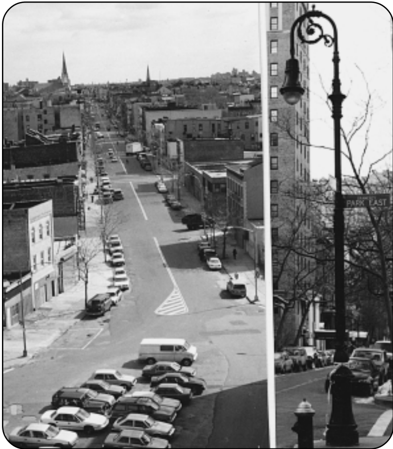
Manhattan Ave. looking from Ash St. toward Driggs Ave.

While the 197-A plan is a guide for future development, upcoming construction projects are the key to fast track plan recommendations. A promenade on the Newtown Creek at the end of Manhattan Avenue is a plan recommendation that can become a reality through the Manhattan Avenue reconstruction project. Once a part of the original design, the promenade had been removed from the final design. In addition, Bishop's Crook Lampposts were originally designated for streets only between Calyer St. and Greenpoint Ave. and not the full length of the Avenue. Through calls to City Agencies and petitions containing photo collages illustrating the Promenade and lampposts, the Museum has made and is attempting to make these recommendations a reality. We received notification that the lampposts have been incorporated into the design throughout the length of the Avenue. We are awaiting final word on the status of the Promenade.